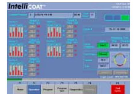
PLC controlled heating