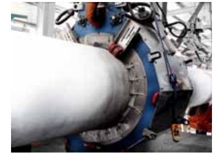
Canusa-CPS IntelliCOAT™ equipment